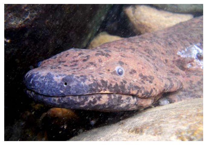
Figure 2. A Chinese giant salamander ( A. davidianus ) that was caught and later released as part of our range wide ecological surveys in China