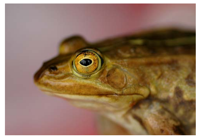
Figure 4. The pool frog ( P. lessonae ) at one of the reintroduction sites in the England; disease risk analysis has been an important component of this project.

in the 1990s to online reporting as part of the Garden Wildlife Health project which began in 2013. The latter also includes wild reptile disease investigation, a neglected topic, for the first time in Great Britain (i.e. England, Scotland and Wales). The established network facilitates horizon scanning and provides an early warning system for novel threats, such as the potential risk of incursion of Batrachochytrium salamandrivorans into wild amphibians, and reports findings directly to government and the OIE.