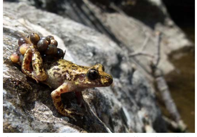
Figure 1. The Mallorcan midwife toad ( A. muletensis ) has been the focus of field interventions to mitigate the impacts of chytridiomycosis

herpetological conservation around the world while delivering direct conservation outputs in the present.