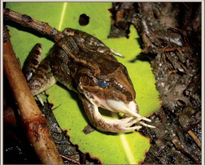
FIG. 1. Capture of a crab of the genus Uca by Leptodactylus fuscus in the mangrove forest on the Bragança Peninsula, Pará, Brazil.

Leptodactylus fuscus is a "sit-and-wait" forager (Perry and Pianka 1997. Trends Ecol. Evol. 12:360–384), which typically feeds on small arthropods, principally Isoptera and Coleoptera, as well as insect larvae (De-Carvalho et al. 2008. Biota Neotropical 18:105–115). Between April 2008 and May 2009, 30 L. fuscus (7 males, 10 females, and 13 juveniles) were recorded on the Bragança Peninsula in the Brazilian state of Pará. The local mangrove forests cover a total area of ca. 467 km 2 of mudflats, and are dominated by tree species of the