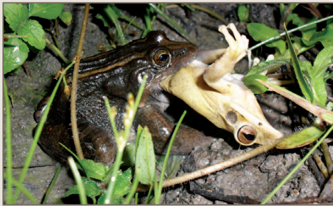
FIG. 1. Adult male Leptodactylus latrans predated an adult male Hypsiboas raniceps .

Leptodactylus latrans is also a medium-sized anuran with a wide distribution in South America, occurring in Paraguay, Argentina, Uruguay, and practically all of the Brazilian territory (Oliveira et al. 2009. Biodivers. Pampeana 7[1]:44–46).