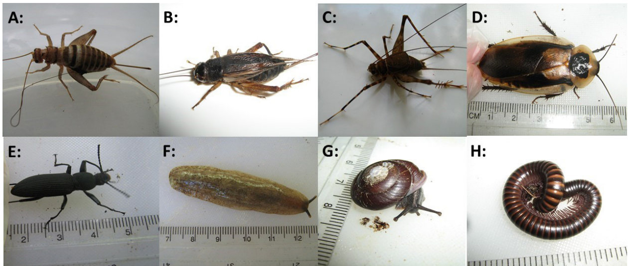
Fig. 2. Cultured species at the CBP in Dominica. (A) Grylodes sigillatus . (B) Gryllus assimilis . (C) Caribacusta dominica . (D) Blaberus discoidalis . (E) Zophobas atratus . (F) Veronicella sloanii . (G) Pleurodonte dentiens . (H) Leptogoniulus sp.

These were removed from housing units after two weeks, or sooner if hatchlings were observed (Fig. 3B). After removal, oviposition sites were placed into separate housing units until all 1 st instar crickets hatched and exited the nest box. The substrate in the oviposition sites was kept moist at all times.