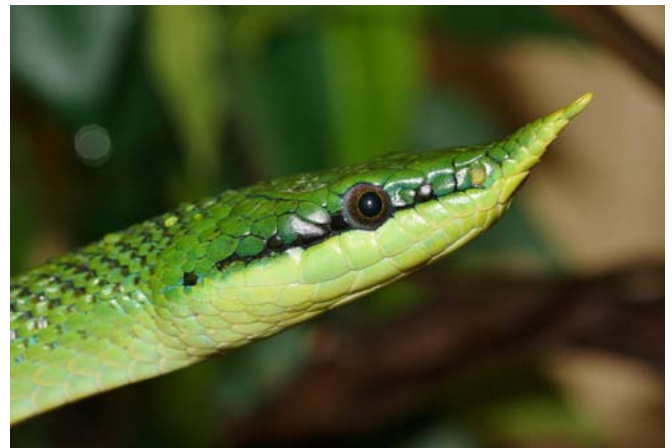
Figure 1: Adult male G. boulengeri at ZSL London Zoo

From a search on the Zoological Information Management System (ZIMS) and several online interest groups G. boulengeri was assessed to be relatively common in captivity, both in the private and professional sectors. However, so far, published peer-reviewed data on