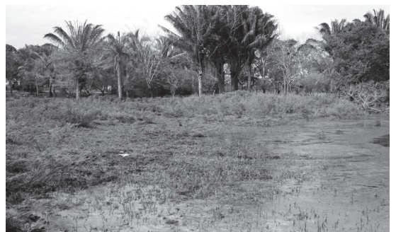
Figure 5. Location 5 Floodplains in Caimanera area Departamento of Sucre.