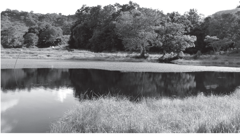
Figure 2. Location 2 lagoon at Hacienda La Condesa. ◀