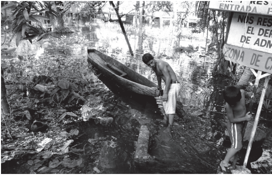
Figure 3. Location 3, Guarinócito.