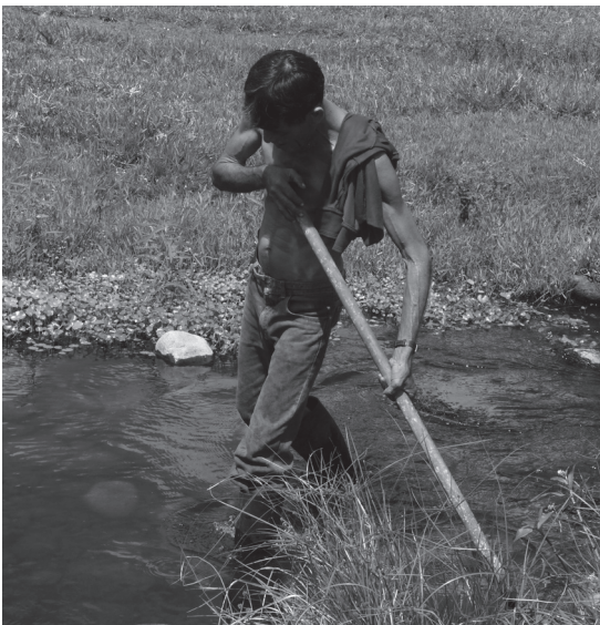
Figure 4. Searching vegetation mats for Typhlonectes natans .