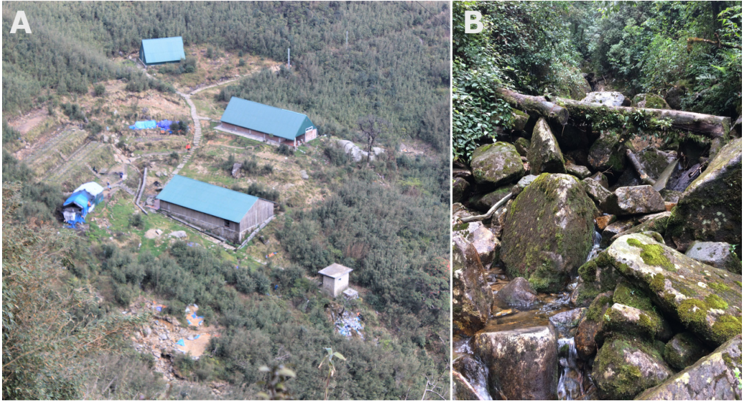
Figure 1. (A) Macrohabitat of Oreolalax sterlingae at the type locality, note the gravel mining in the stream at the bottom of the image; (B) Microhabitat of O. sterlingae at a relatively undisturbed site on Mount Fansipan at 2511 m a.s.l.

Voucher specimens were not collected as the species is easily identifiable, the specimens were not a substantial distance away from the type locality and morphological characters conformed with those in the original species description (Nguyen et al. , 2013). On 21 March 2018, we surveyed Mount Pu Ta Leng, Bat Xat NR, Bat Xat District, Lao Cai Province, Vietnam (22.4325° N, 103.6300° E, 2345 m a.s.l.), 20 km northeast of the type locality. We observed several O. sterlingae tadpoles (but no adults) in a large pool in a 2 m wide stream in lightly disturbed evergreen forest. A tissue sample (tail clip) for molecular analyses was taken from a freshly euthanised tadpole at Stage 27 (Gosner, 1960) prior to formalin fixation; the specimen was deposited at the Vietnam National Museum of Nature (VNMN 2019.006). Our survey effort was limited due to the rugged topography of the area and logistical constraints and we did not identify any suitable habitat between 2500–2900 m a.s.l. However, the species is likely present at higher elevations than we found it on Mount Pu Ta Leng as better quality habitat was present in the area relative to known habitat on Mount Fansipan. It may also occur on Mount Ky Quan San but further survey work is needed.